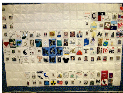
(Periodic table Quilt)

They also received an 8x10 copy of the Women of the Periodic Table poster with information about each of the female chemists.