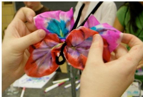
An art project using color chromatography to make a butterfly.